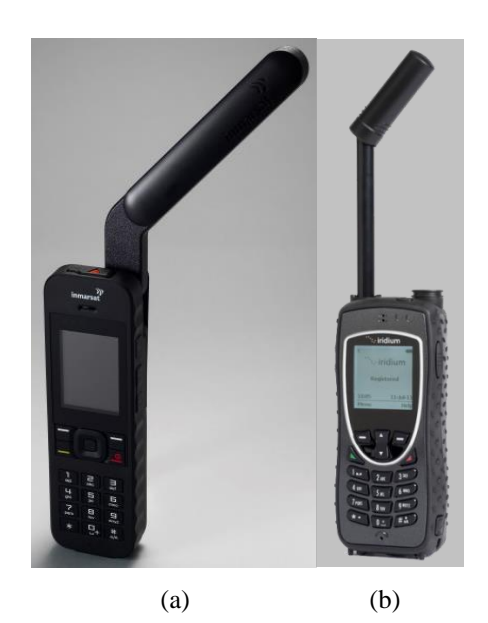
Figure 2. Satellite Mobile Phones: (a) Inmarsat IsatPhone 2 and (b) Iridium Extreme 9575

A comprehensive review of satellite communications for emergency resonders can be found in the reference.